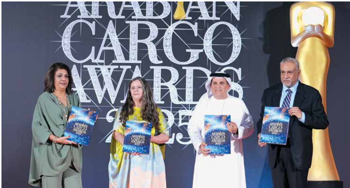
The collector's edition of Arabian Cargo Awards was unveiled on stage.