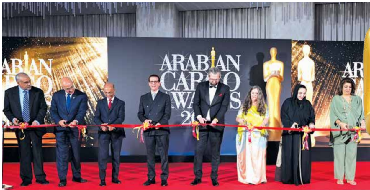
The Arabian Cargo Awards officially began with a ceremonial ribbon cutting by dignitaries at the event.

The Arabian Cargo Awards concluded with resounding success this year, uniting the region's leaders in air cargo, logistics, and supply chain under one roof. The awards underscored the region's stature as a global logistics powerhouse and reaffirmed its role shaping the future of global freight.